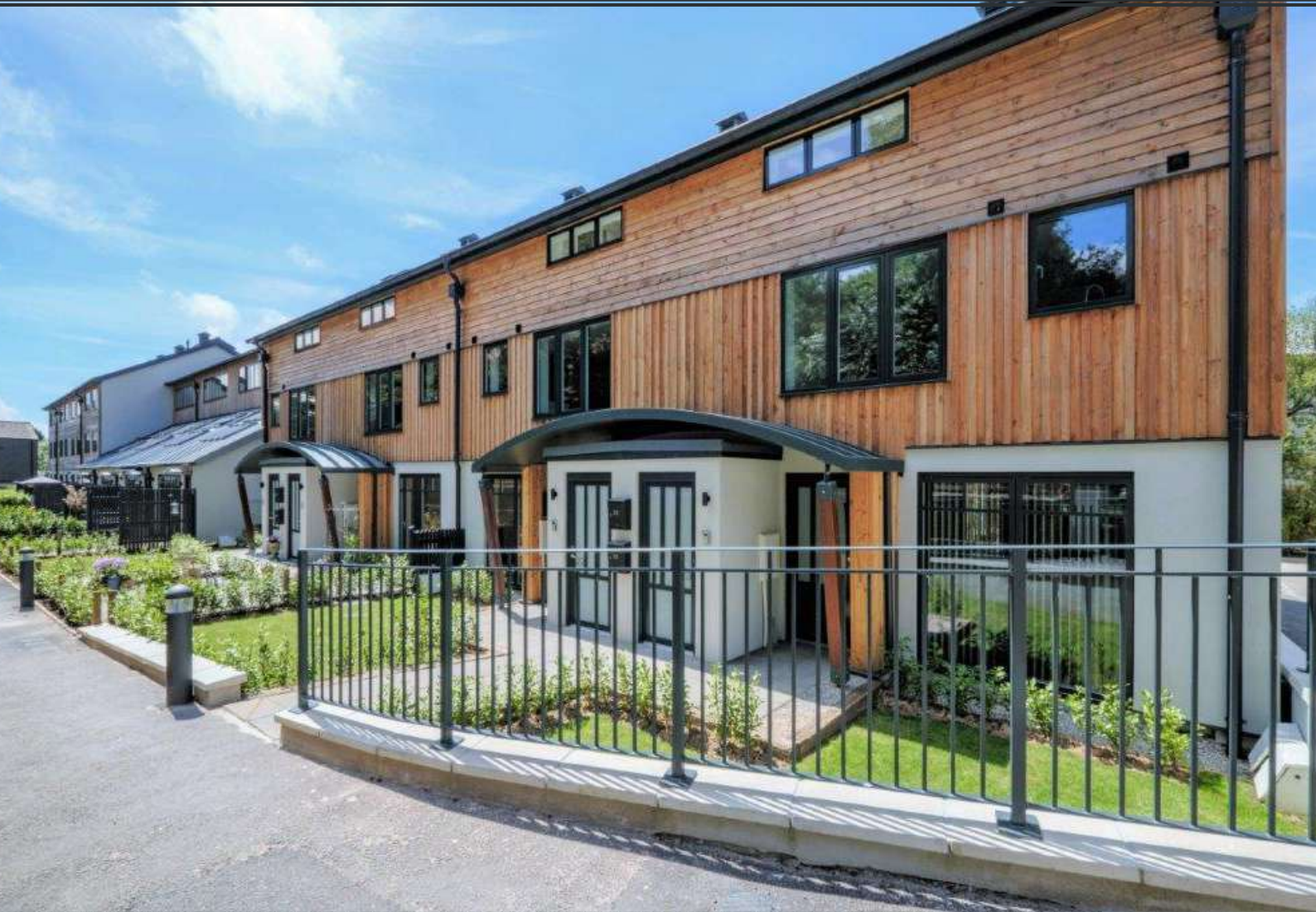
Duplex Home - Brunel Two, Lostwithiel £325,000